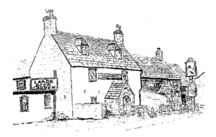
63 East Street, Corfe Castle BH20 5EE