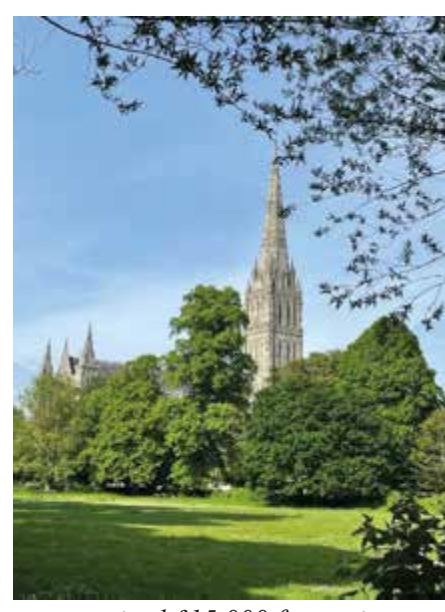
The Secret Gardens events raised £15,000 for projects at Salisbury Cathedral.

"The weather was perfect and the gardens were in full bloom. "The proceeds will surely make a difference to the preservation of our medieval masterpiece. "Thank you to all who attended and supported our flagship event, and our generous garden owners and the 70 volunteers who made it possible."