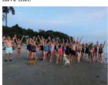
The festival's traditional autumn equinox swim

Sue said: "I have been especially blown away by the children and young people I have met.