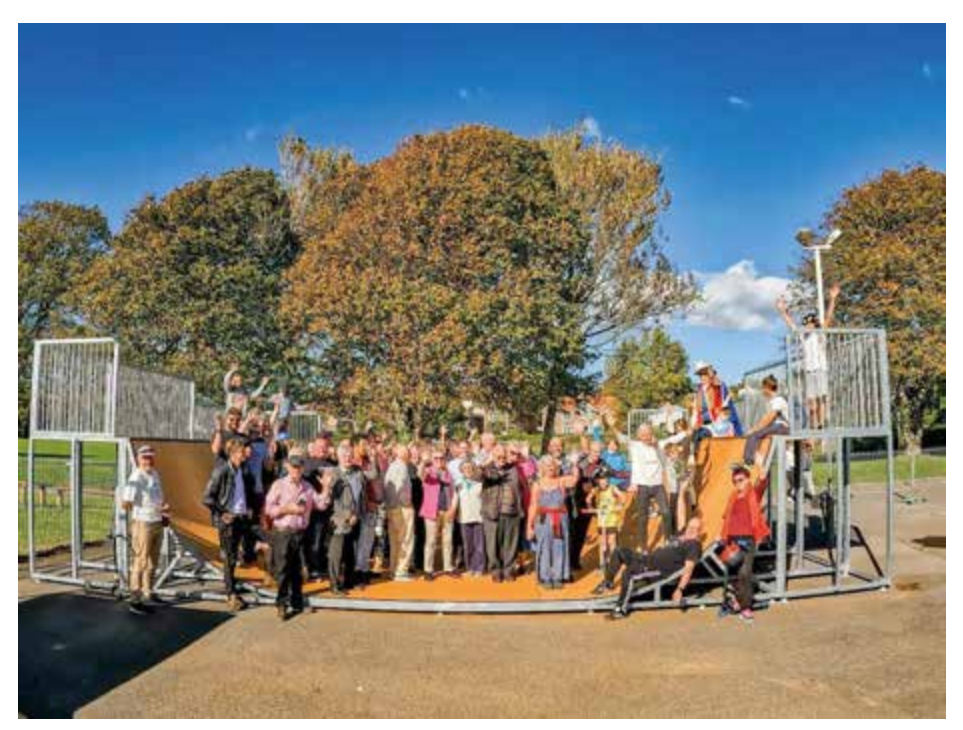
Members of the Swanage Skatepark Community Project

www.swanageskateparkcommunityproject.com