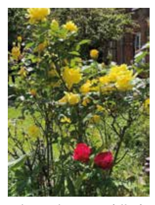
The gardens were full of beautiful roses.

A hot and sunny afternoon attracted crowds of people to the nine gardens that were open and swelled the charity's coffers by £15,000.